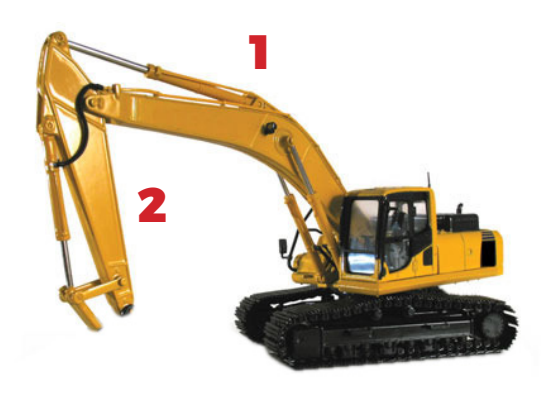
Two-Piece Boom (Increases rigidity and reduces cost compared to a 3 piece boom)