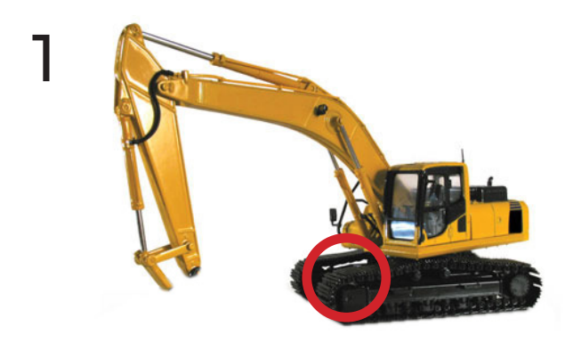
Existing Bulldozer Blade Mounts (To make installation simpler)