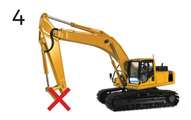
Quick Coupler on End of Boom Adds Extra Weight (To be used only if required)